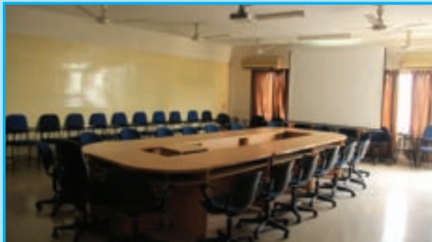
CDD Conference hall