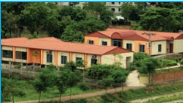
Entrance of training complex