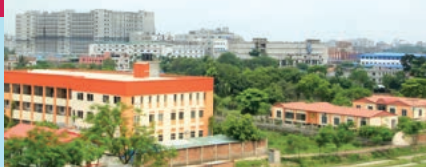
Office building and training complex