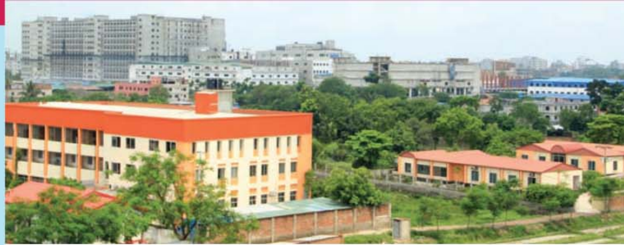
Office building and training complex