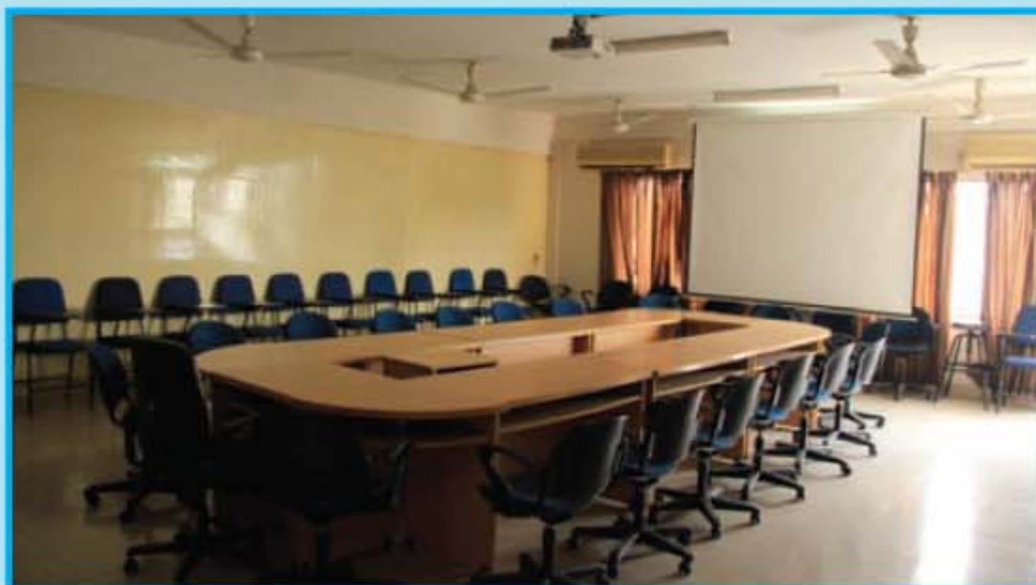
CDD Conference hall