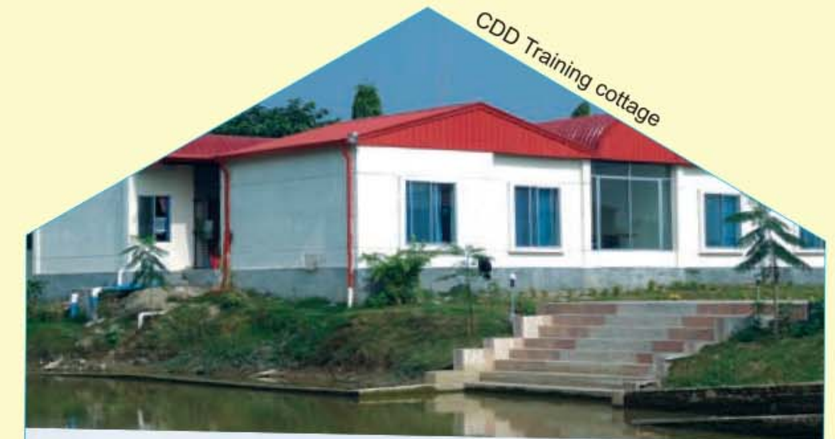
CDD Training cottage

Are you looking for training facilities? If yes!