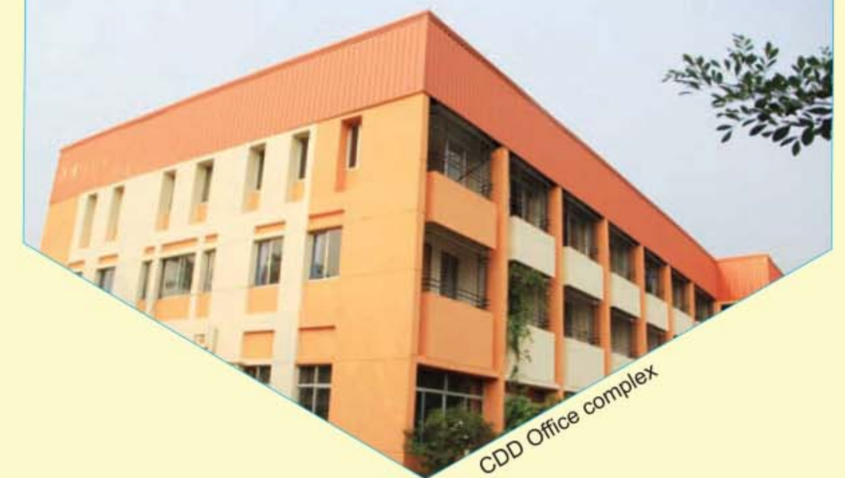
CDD Office complex

CDD Training and Learning Centre (TLC) offers a complete solution for a comfortable, affordable and accessible venue for training, meeting, workshop or any other official occasion in a calm & quiet environment close to Dhaka city