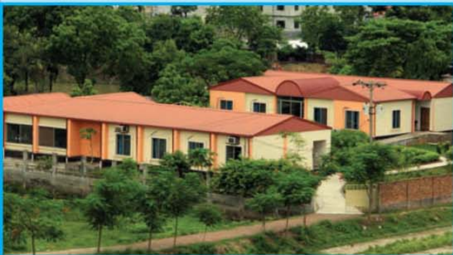
Entrance of training complex