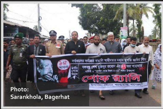
Photo: Sarankhola, Bagerhat