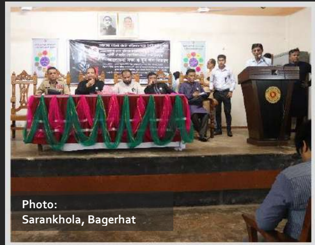
Photo: Sarankhola, Bagerhat