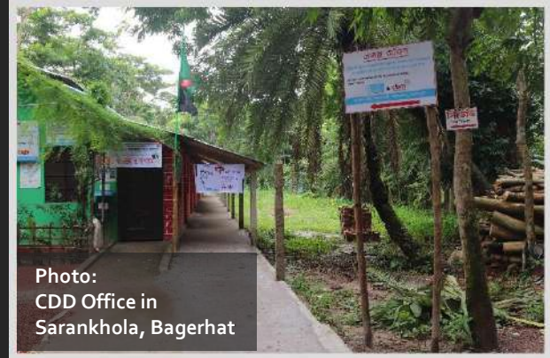
Photo: CDD Office in Sarankhola, Bagerhat