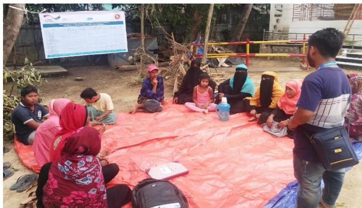
Photo: Bi-weekly meeting of SHG