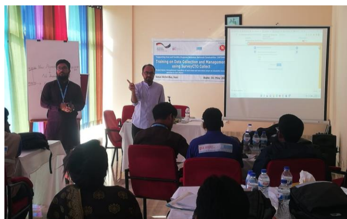
Photo: MEAL Officer facilitating the Training Session.

The Centre for Disability in Development (CDD) has organized a day-long training for the functional capacity building team on data collection and management using SurveyCTO Collect on 31 May 2022 at Orchid Blue hotel, Inani, Cox's Bazar. In total, 25 participants (Male: 19, Female: 06, Person with Disabilities: 01) from both CDD Ramu & Teknaf Office have joined the training. The training's objective was to orient FCBT members on data collection and management strategy using SurveyCTO Collect for reporting Rehabilitation activities.