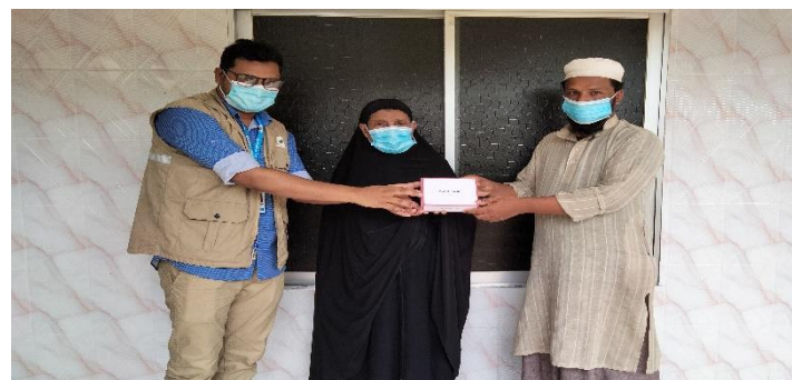
Photo: Rehab officer provided Hearing Aid to a beneficiary

In May 2022, 43 different assistive devices were distributed among 39 beneficiaries. The distributed devices include 12 toilet chairs, 17 hot water bags, 06 squeeze balls and one piece of urine pot, hearing aid, alphabetic puzzle, kneecap, spirometer etc.