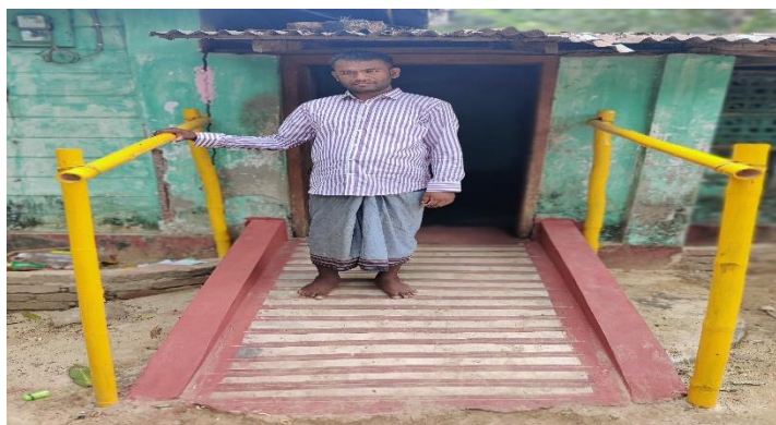
Photo: Ramp with handrail for toilet entrance

In May 2022, the Functional Capacity Building Team provided home modification services (e.g., instalment of a parallel bar with slope, a ramp with handrail for door and toilet entrance, tube well platform, kitchen, and bathing place modification) to 41 persons (Female 66%, Male 34%, person with disabilities 81%) for their better access and functional independence in activities of daily living.