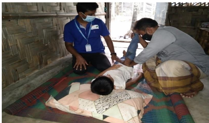
Photo: Therapy Assistant demonstrating caregiving strategy to caregiver

Functional capacity-building professionals transferred skills to 20 caregivers to enable them to extend basic capacity-building services to family members with disabilities in the service month of May 2022.