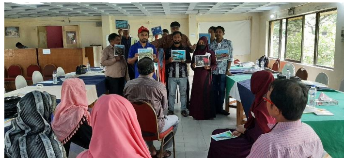
Photo: Training participants demonstrating the cause-effect relationship of Climate Change.

Chaki and his team. In total, 15 taskforce members (Male: 10, Female: 05, Person with Disabilities: 04) from Baharchhara Union of Teknaf have participated in this training. The main objective of the training is to make the task force members aware of disability inclusive DRR and CCA so that they can practice in their implementation areas and policy level.