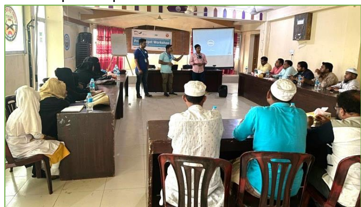
Photo: A facilitator from CDD is talking about Pre-Budget issues before the participants.

The Centre for Disability in Development (CDD) has arranged a Consultative Workshop with Teknaf Sadar Union Council to Prioritize Schemes for Inclusion into Union Council Development Plan and Budget Allocation. The workshop was organized at Alo Resort of Teknaf Upazila On 24 th May 2022. A total of 19 (Male:12, Female: 07; Participants with disabilities: 08) representatives have joined the workshop. The participants were local government representatives from Teknaf Sadar Union, including the Chairman, the Union Administrative Officer, the Members, and combined representatives from four different Self-help Groups of Teknaf Union.