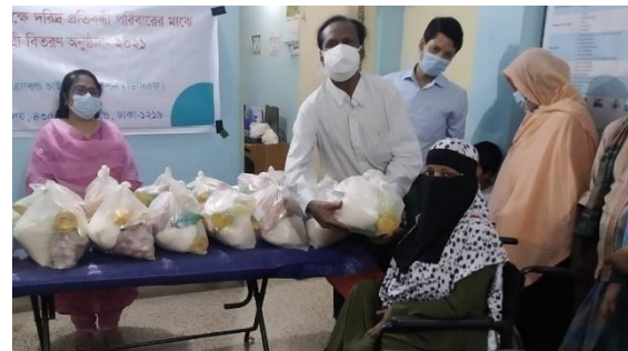
Figure: Person with disability is receiving relief support at W-23, DNCC

In W-23 of Dhaka North City Corporation (DNCC), project communicated with Rupali Bank for support persons with disabilities who suffered due to COVID-19. As a result of successful networking, Rupali Bank provided BDT 25,000 from their CSR Fund to support persons with disabilities and low-income people at W-23 of DNCC. Through the support 50 people including 46 persons with disabilities received food package.