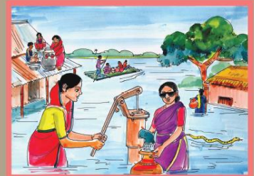
সেন্টার ফর ডিজএ্যাবিলিটি ইন্ ডেভেলপমেন্ট (সিডিডি)

দুর্যোগ ঝুঁকি হ্রাস জেভার ও প্রতিবন্ধিতা