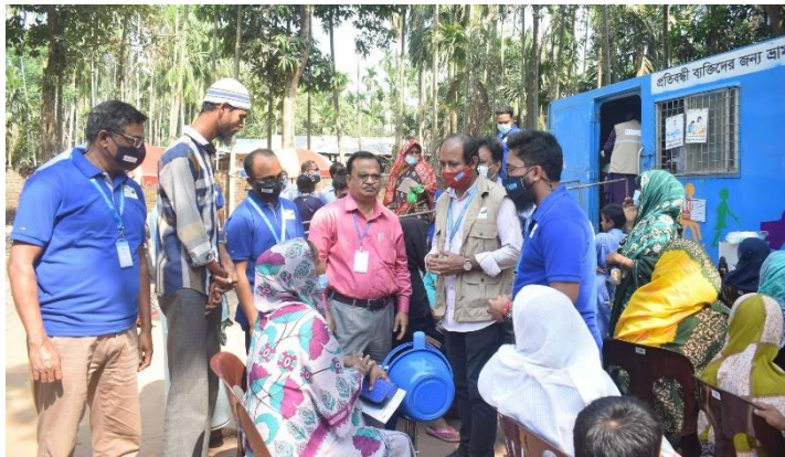
Photo: Additional Secretary (MoDMR) discussing with a beneficiary of REHAB van service.

The visiting team observed the mobile rehabilitation van service and the mode and types of services provided by the mobile rehabilitation Van. During the conversation with CDD staff, they applauded the frequency of services, alternative strategies for continuing services, and the overall sustainability of the project activities.