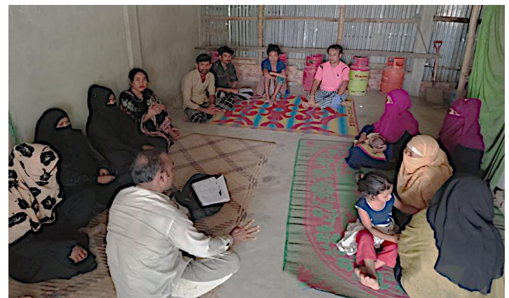
Photo: Bi-weekly meeting of SHG