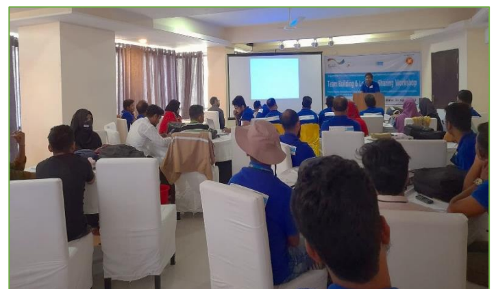
Photo: Facilitator sharing learnings among the participants

The Centre for Disability in Development (CDD) has organized a day-long workshop for CDD-GIZ Project Staff on Team Building & Learning Sharing on 21 April 2022 at Hotel Long Bay of Inani in Cox's Bazar. In total, 48 participants (Male: 40, Female: 05, Person with Disabilities: 03) from both CDD Ramu & Teknaf Office have joined the workshop. The workshop's objective was to build team engagement with each other for a better and smooth intervention of the project and identify the challenges of project intervention and share the learning with other staff.