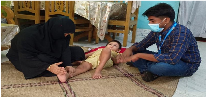
Photo: Rehab Officer demonstrating caregiving strategy to caregiver

Functional capacity-building professionals transferred skills to 62 caregivers to enable them to extend basic capacity-building services to family members with disabilities in the service month of April 2022.