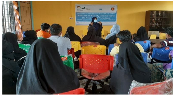
Photo: CPP volunteers facilitating a session

The orientation on disability-inclusive search and rescue of CPP volunteers started on 10 April and continued till 17 April. The volunteers, who got the ToT on disability-inclusive search and rescue earlier, facilitated these orientation sessions. In total, 139 CPP volunteers from 8 units participated in these orientation sessions, of which 72 were male participants, and 67 were female participants.