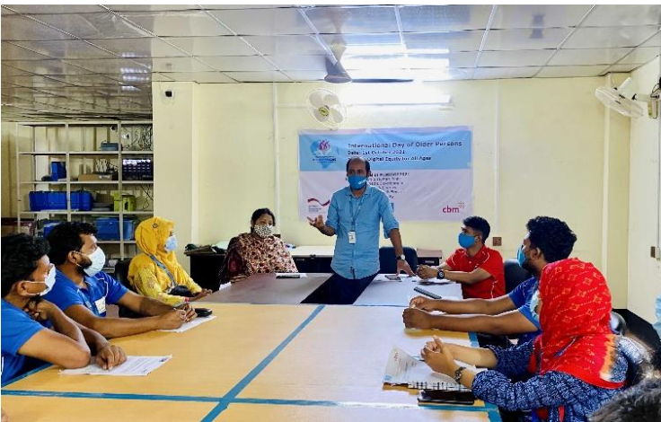
Photo: CDD staff observing international day of older persons

CDD staff observed international day of older persons 2021 at the Ukhiya office. This year's theme was "Digital Equity for All Ages"