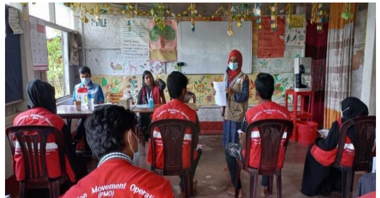
Photo: Session on Disability and Washington group short set questionnaire at BDRCS distribution center, Camp 13