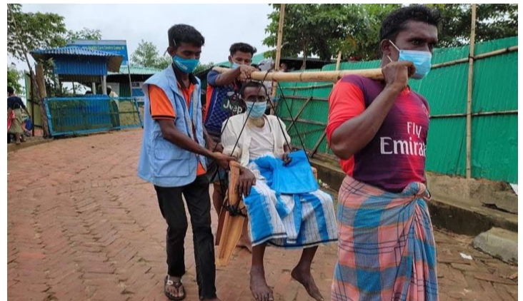
Photo: Clients referred for Covid-19 Vaccination

Total 149 individuals were referred by CDD for vaccination program from at camp 8w, 18, 11, 13 etc. Among 255, 47 were male and 102 female. 83.22% were older persons and only 16.78 people were adult.