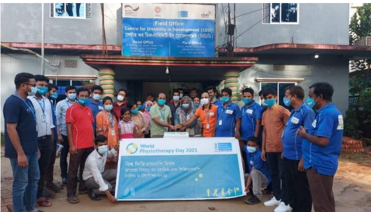
Photo: CDD staffs observing world Physiotherapy Day 2021