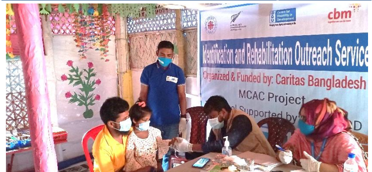
Photo: Outreach Rehabilitation camp for Caritas Bangladesh