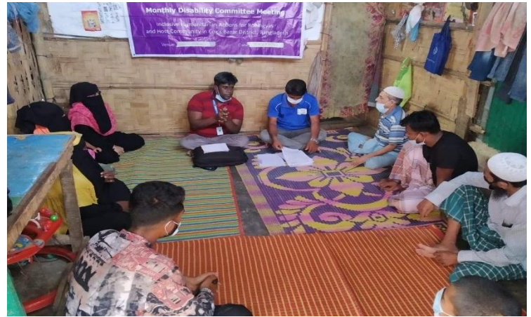
Photo: DPO consultant facilitating a disability support committee meeting at Rohingya community

Organized 6 SHG meetings for 3 SHG & 4 DSC meetings for 4 DSC, where the discussion was on experience sharing on capacity building training, discuss exposure visit, advocacy planning for visiting UNO and social welfare office, getting ID card for a person with disabilities, update of COVID 19 vaccination & SWOT analysis for teams. 1 SHG meeting was organized with Cox's Bazar SHG members where SWOT analysis and discussion about goals and objectives of SHG was done.