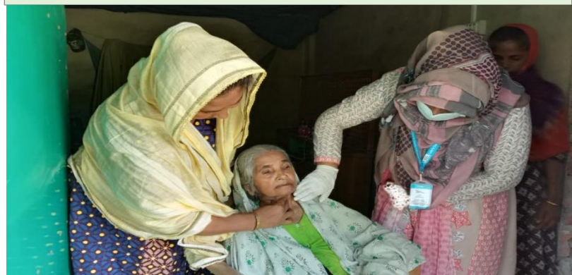
Figure: Rehabilitation officer assessing speech related impairment in a beneficiaries at her home