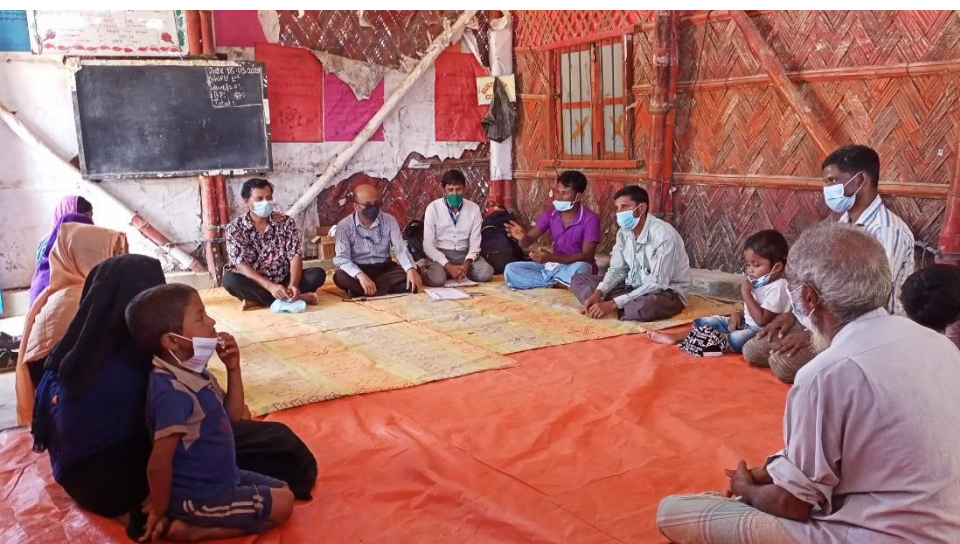
Figure: Beneficiaries from Disability committee receiving training on rights of person with disabilities, barriers of accessibility, ways to address those issues etc. which was facilitated by DPO consultant