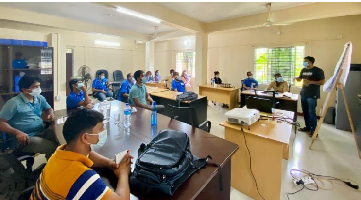
Figure: MoFA extension project supported staff received 2 days (2 batch) orientation training on MoFA extension project implementation plan, communication flow, qualitative reporting aspects, inclusion activities, COVID related safety precautions and introduction with CBM team members.

First Phase: May 2019 - May 2020; Extension Phase: June 2020 - December 2021