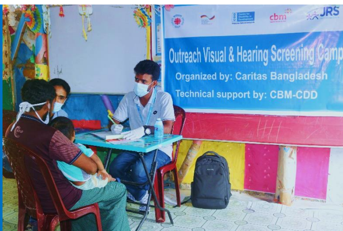
Figure: Outreach Hearing & Visual camp which was organized by Caritas Bangladesh and CDD provided technical support to assess 32 children with different hearing and speech difficulties.