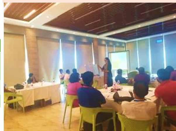
Figure: Facilitation of the training "Orientation on Disability inclusive communication" at Cox's Bazar.