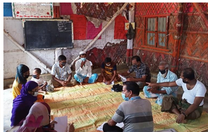
Figure: Awareness session on disability awareness in the Rohingya community.