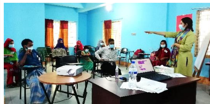
Figure: Self Help Group (SHG) members attending training on 'SHG: Basic and purpose.'