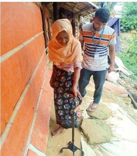
Figure: A Beneficiary using four point stick in the Rohingya Community provided by CDD