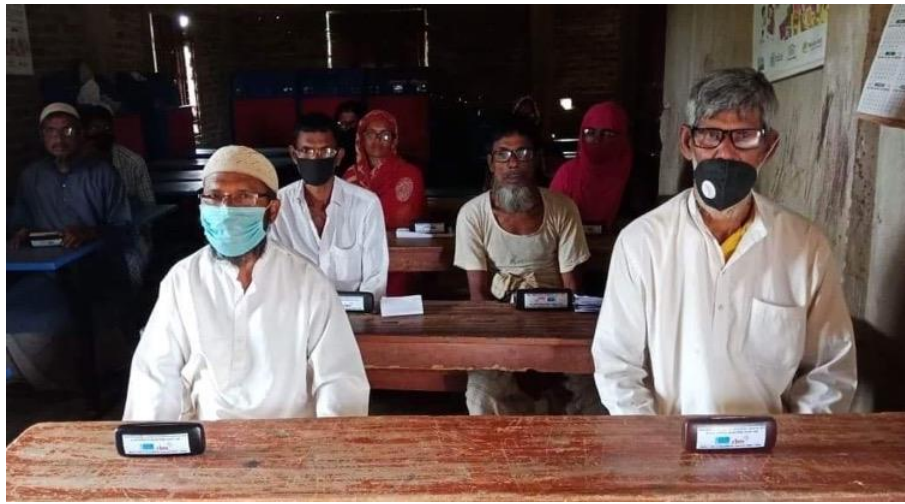
Figure: 2 Beneficiaries those who received spectacle during the Visual & Hearing screening outreach camp at Host community