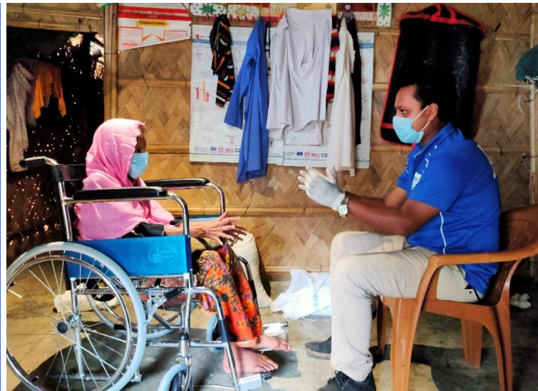
Figure: 1 Rehabilitation professional of Home Based Rehabilitation team teaching home exercises to a beneficiary inside her shelter in the Rohingya camp while maintaining COVID related precautions.