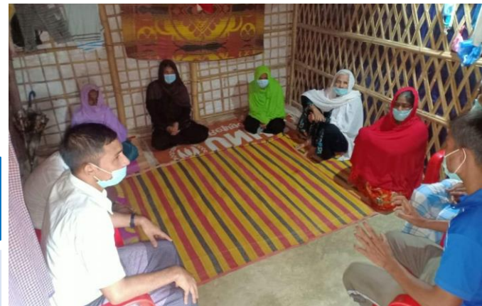
Figure: 4 A total of 14 community awareness session was conducted in the Host and Rohingya Community on disability awareness, COVID related precaution & hygiene practice.