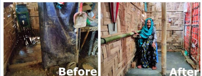
Figure: 5 Modification of Bathing space for a women with disability in Rohingya community.