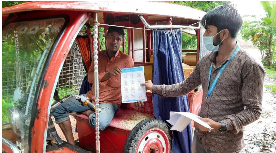
Figure: 3 Community mobilizers of Home Based Rehabilitation team distributed hand washing steps and other awareness materials among the Camp & Host beneficiaries.