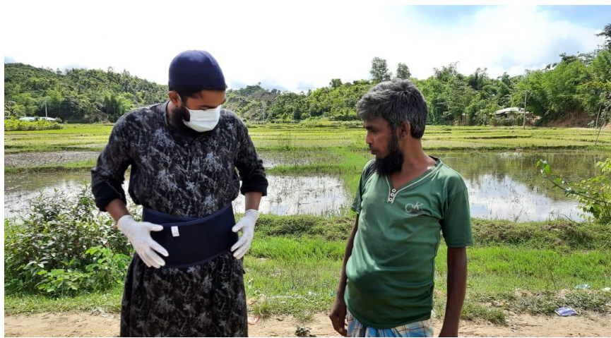
Figure: 1 Therapy assistant of the HBR team demonstrating the use of an assistive device to a beneficiary from the host community in Ukhiya, Cox's Bazar, Bangladesh.

Due to increasing number of COVID-19 patients in the Cox's Bazar district, Red Zone wise lockdown was imposed in specific areas for the period of 6 to 19 th June, which later extended till 30 th June. HBR teams avoided those areas of lockdown and continued services for the host beneficiaries.