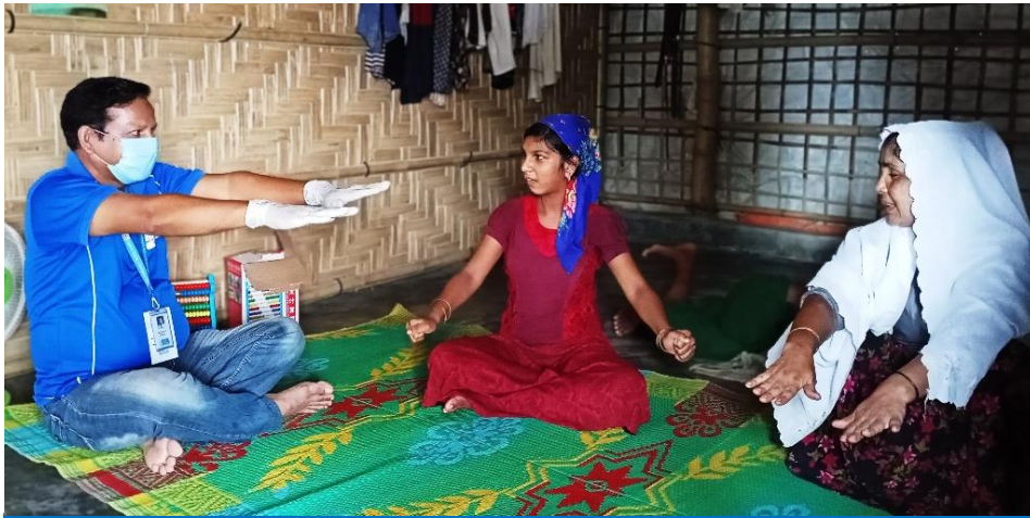
Figure: 2 Therapy assistant of the HBR team demonstrating active exercises to a Rohingya child with disability, while mother of that child also participating and motivating the child during exercise.

Following IOM funded assistive devices has been distributed in the Rohingya and host community by the Home Based Rehabilitation (HBR) Team