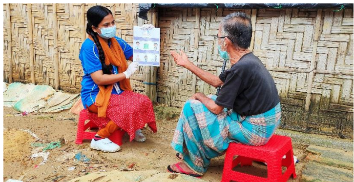
Figure: 4 Sharing COVID-19 related hygiene awareness with Rohingya person with disabilities.