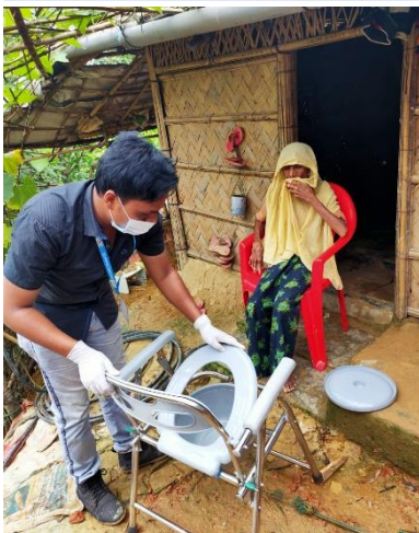
Figure: 3 Rehabilitation professional of the Home Based Rehabilitation (HBR) team demonstrating the use of a toilet chair to a Rohingya women with disability at her shelter inside the Rohingya Camp during the AD distribution camp.