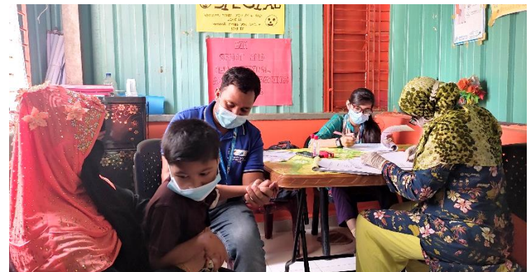
Photo: CDD Rehab professionals assessing beneficiaries at IOM health post at camp 13