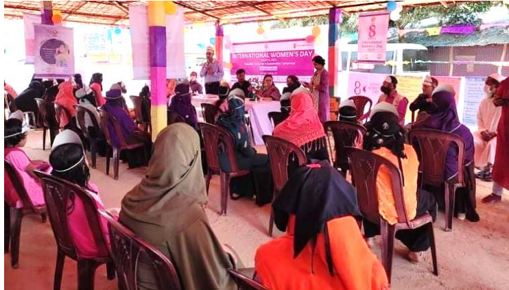
Photo: Women's Day observation at Rohingya Camp 13

CDD staff along with project participants those who were women and girls with disabilities attended the observation of International Women's Day on 8 th March 2022 which was organized at CIC camp 13 with collaboration of different mainstreaming organizations. This year's theme was "Gender equality today for a sustainable tomorrow."