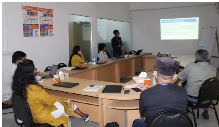
Photo: During Training session on Disability Inclusive Communication and Accessible Materials

3. DITU conducted a 3-hour long session for CMU's Communications and Advocacy Working Group (CAWG) members on "Disability Inclusive Communication and Accessible Materials" on March 15, 2022. The goal of the training was to ensure the accessibility of the word documents, PPT, video and how to communicate with persons with disability while considering disability inclusive communication etiquette. Participants who attended were from different consortium partners and a total of 6 participants attended the training. Among the 6 participants 3 were women and 3 men.