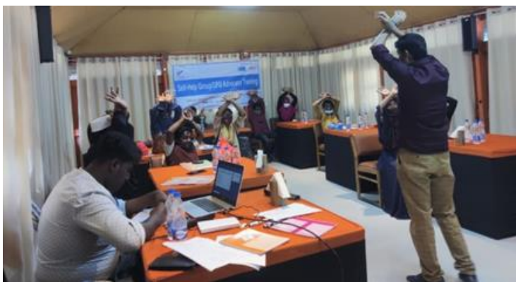
Photo: Participants are taking part in an energizer.

1. CDD and CBM organized Advocacy Training to enhance the knowledge and capacity of SHG group members on advocacy and to prepare action plan on advocacy related activities among the local govt. authorities and humanitarian actors. The training was held separately on 28th February and 7th March 2022 at Foodies Cafe & Catering, Ukhiya, Cox's Bazar. Total 22 participants from SHG group Oikko, Odhikar, Alor Dishari and Nirvoya attended the training.