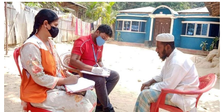
Photo: Rehab professional conducting clinical assessment

Home Based Rehabilitation team of CDD provided clinical assessment and therapeutic services to 14 people with disabilities at Horinmara, Rajapalong; those who are referred and project participant of World vision.