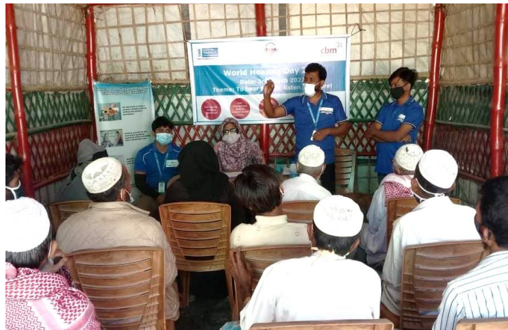
Photo: Audiometric technician sharing tips on hearing awareness with the community people at Rohingya camp

3 rd March 2022, was World Hearing day. This year's theme was "To hear for life, listen with care." CDD observed this day by arranging hearing screening camp and awareness sessions at both Rohingya camp and Host community. People with disabilities actively participated and shared their voice during the awareness session.