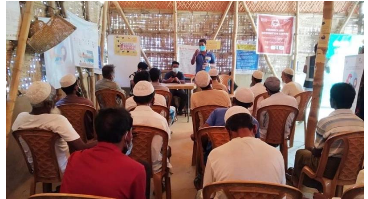
Photo: Awareness session on disability sensitization conducted in collaboration with Danish Refugee Council (DRC) at their hub at Camp 11.

Community awareness session on disability was conducted in FDMN and host community. A total of 14 awareness sessions (Host Community: 5, FDMN Community: 9) were conducted where 125 persons participated including people with disabilities, caregivers, family members, Majhi's etc.