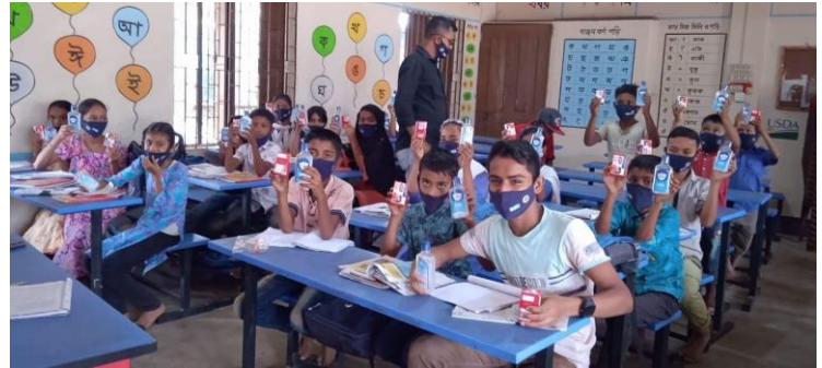
Photo: Some students who received hygiene materials

CDD has distributed some hygiene kits among the students of Moricha Palon Government Primary School which included cloth mask (3000 Pcs), Hand sanitizer (300 Bottle), Hand wash (300 Bottle), Soap (600 Pcs). It was funded by Malteser International.