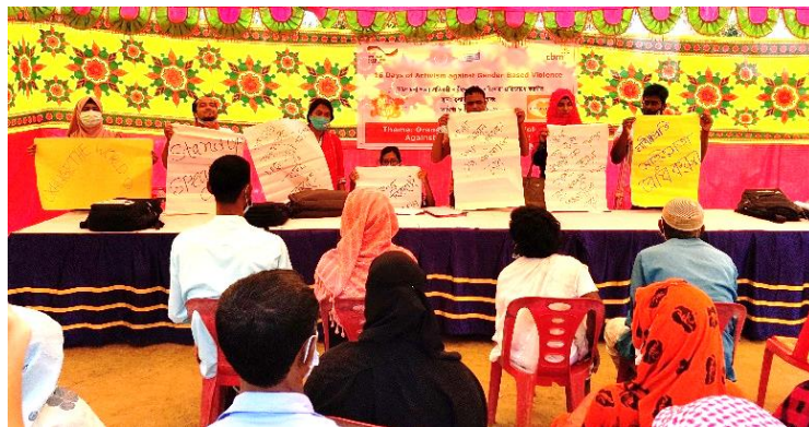
Photo: Participants holding festoons in discussion session on 16 Days of Activism against Gender-Based Violence

CDD and CBM organized discussion events, awareness raising session, and storytelling competitions as part of 16 Days of Activism Against Gender-Based Violence on 07 and 08 December 2021 at CDD Ukhiya office, Cox's Bazar and Tulatoli, Ratna palong. CDD staffs, SHG members and persons with disabilities from host communities attended the events.