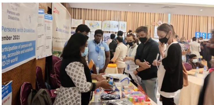
Photo: CDD Team is showcasing in the exhibition event

CDD and CBM observed International Day of Persons with Disabilities 2021 in Rohingya camp and host communities. On 2 nd December, CDD arranged discussion and inclusive game competition at Camp-18 and Mobile Bus Camp. Apart from this, CDD attended a stall exhibition at Arunodaya School and an event organized in collaboration with Gender in Humanitarian Action Working Group (GiHAWG) and Age and Disability Working Group (ADWG) at Long Beach Hotel, Cox's Bazar. CDD also joined another event organized jointly by HI, BRAC, PRIYA and ADWG at Best Western Heritage Hotel, Cox's Bazar and received first prize.