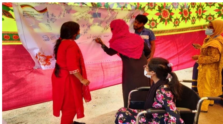
Photo: Participants writing their wishes against GBV