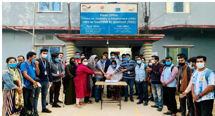
Photo: CDD's inclusive Rohingya response staff during the cake cutting session to observe the 4 th anniversary