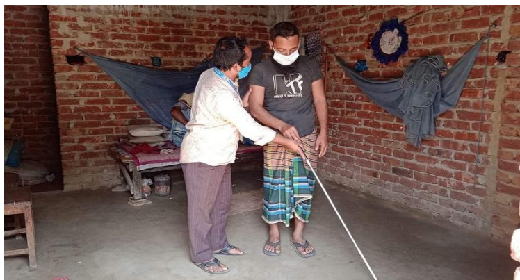
Photo: Therapy assistant teaching a person with visual impairment to use white can

A total of 875 different assistive devices like spectacle, toilet chair, bed pan, urine pot, and walking stick etc. have been provided among 334 female and 360 male beneficiaries from camp and host communities.