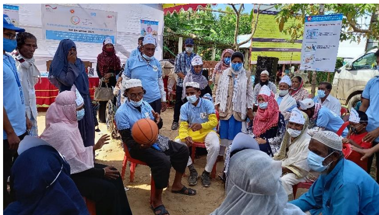
Photo: Persons with disabilities attending an inclusive sports event during the observation of International Day of Persons with disabilities organized by CDD.