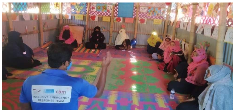
Photo: Awareness session at Rohingya community

Community awareness session was conducted in Rohingya and host community. A total of 10 awareness sessions were conducted where 107 persons participated including person with disabilities, caregivers, family members, Majhis etc.