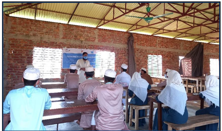
Photo: Community Awareness session at host community

Community awareness session was conducted in FDMN and host community. A total of 40 awareness sessions were conducted where 166 persons participated including person with disabilities, caregivers, family members, Majhi's etc. In case of Self-Help group and Disability support committee meeting the team organized 11 meetings (7 SHG & 4 DSC meetings) where the discussion was on experience sharing on exposure visit, discussion on the observation of International Day of persons with disabilities, advocacy planning for visiting different government offices, and update of COVID 19 vaccination.