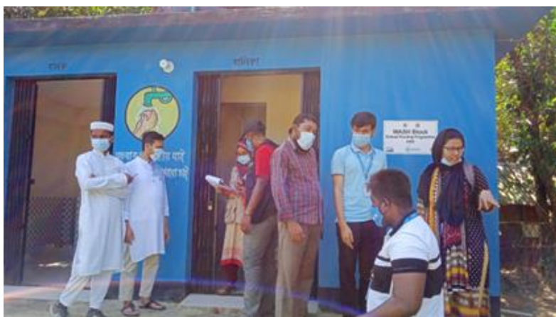
Photo: Accessibility audit conducted at Host community, Ratna palong.