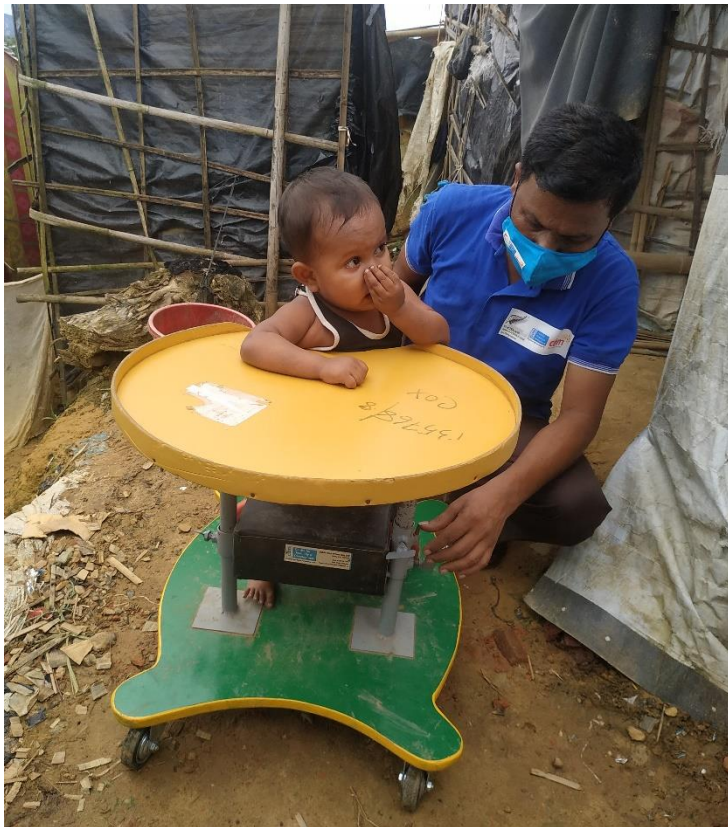
Photo: Therapy assistant adjusting a special chair for a child with disabilities at Rohingya community

A total of 1,387 different assistive devices like spectacle, toilet chair, bedpan, urine pot, and walking stick, etc. have been provided among 698 female and 649 male beneficiaries from camp and host communities.