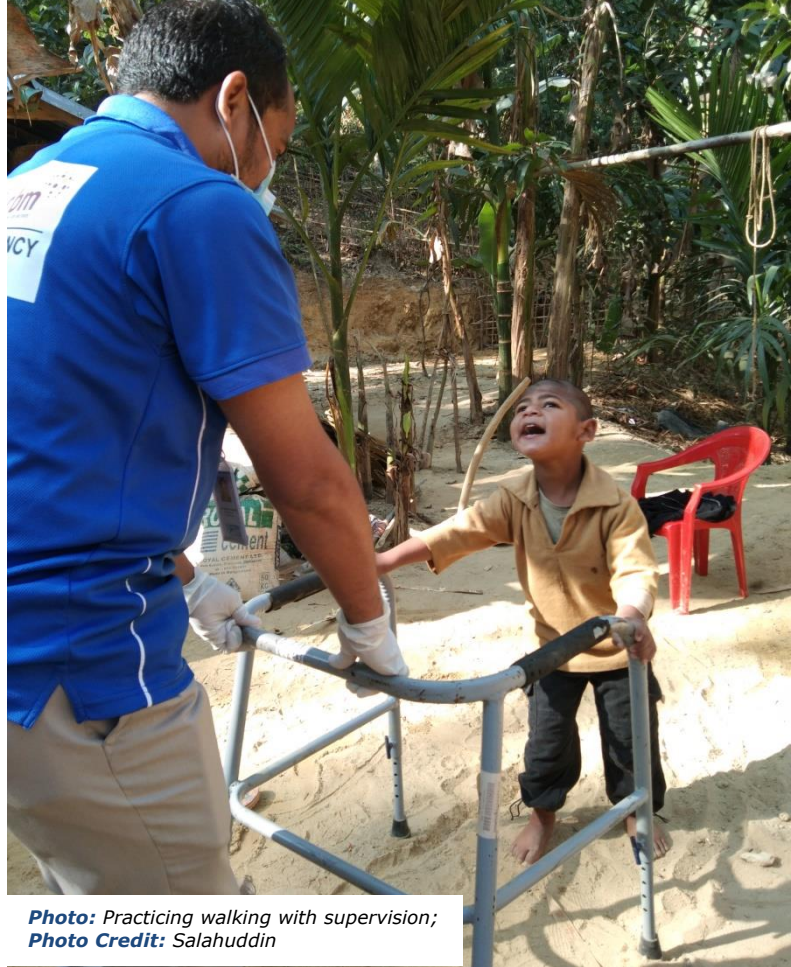
Photo: Practicing walking with supervision

Since 2017 CDD in Partnership with CBM started its health and rehabilitation services for both FDMN camp and Host communities in Cox's Bazar, Bangladesh. The projects have two-pronged approach by prioritizing rehabilitation service provision and disability mainstreaming.