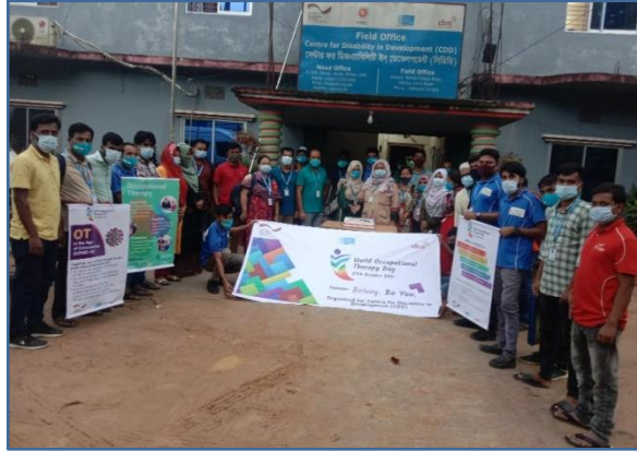
Photo: Celebration of Occupational Therapy Day; Photo Credit: Bashar Ul Alam

On 27 October 2021, CDD observed World Occupational Therapy Day at CDD Ukhiya Office with collaboration with CBM. A total of 50 (male without disability: 33, female without disabilities: 15, male with disability:02, female with disability:00) participants were participated.