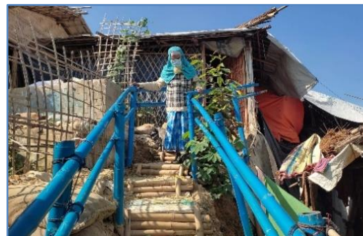
Figure: After receiving therapy & home modification, Md. Islam going downstairs to use toilet independently

He needed support from his granddaughter in performing all the daily activities. The CDD & CBM home based rehabilitation team provided him with therapeutic support, taught him some home exercises, and conducted shelter adaptations to improve his functional ability and to promote independence.