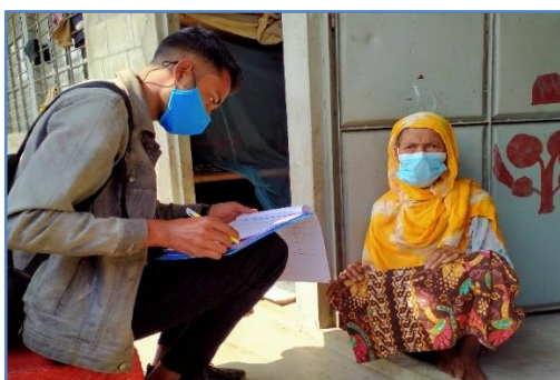
Figure: Enumerator conducting interview of person with disabilities using customized RNA tool at Bhasan Char

During the month of January, a team of 12 member including 8 local trained enumerator, 1 team leader and 3 staff of CDD visited Bhasan Char for an initial need analysis. The objective of the need analysis was to identify the specific needs of persons with disabilities and older people, highlight the gaps and needs, along with recommendations, to promote inclusive response.