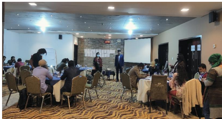
Photo: Training sessions being conducted on disability-specific data collection for WASH actors

Training on Disability Specific Data Collection Tools was organized by CDD and CBM in two batches to orient participants on the basic concept of disability, tools, and methods for disability-specific data collection at Hotel Long Beach, Kalatoli, Cox's Bazar. The training of the first batch was held on 18th January 2022 with 18 participants and the training of the second batch was held on 19th January 2022 with 16 participants from different backgrounds WASH actors like WASH managers, WASH Coordinators, Sr. Officers, etc.