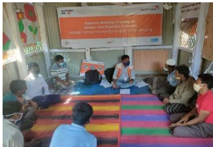
Photo: Community watch group taking capacity building training session on Child Protection and Disability Inclusion.